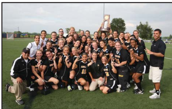
The Adelphi women's lacrosse team won its second straight national championship after defeating West Chester, 17-7, in the title game.

The Northeast-10 has a strong history of nationally ranked teams in all sports. In the 2009-2010 academic year the conference had 74 different teams representing 15 institutions advance to NCAA postseason play.