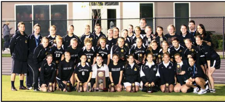
The Saint Rose women's soccer team advanced to the NCAA Division II National semifinals for the second straight year. The Golden Knights finished the 2009 season with a 24-1-0 record.

The institutions that make up the Northeast-10 include Adelphi University (Garden City, N.Y.), American International College (Springfield, Mass.), Assumption College (Worcester, Mass.), Bentley University (Waltham, Mass.), Franklin Pierce University (Rindge, N.H.), Le Moyne College (Syracuse, N.Y.), University of Massachusetts Lowell (Lowell, Mass.), Merrimack College (North Andover, Mass.), University of New Haven (West Haven, Conn.), Pace University (Pleasantville, N.Y.), Saint Anselm College (Manchester, N.H.), Saint Michael's College (Colchester, Vt.), College of Saint Rose (Albany, N.Y.), Southern Connecticut State University (New Haven, Conn.), Southern New Hampshire University (Manchester, N.H.) and Stonehill College (Easton, Mass.).