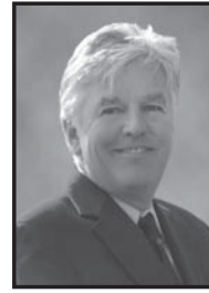
Martin T. Meehan Chancellor

Address: Department of Athletics One University Avenue Lowell, MA 01854 Founded: 1975 Colors: Red, White and Blue Website: www.goriverhawks.com Athletic Phone: (978) 934-2310 Athletic Fax: (978) 934-4027 SID Fax: (978) 934-2313 Campus Safety: (978) 934-2398