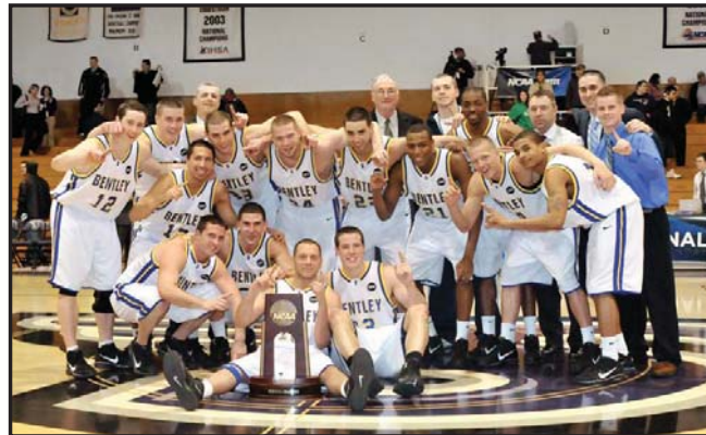
Bentley won its third regional title in the past four years after defeating Philadelphia, 81-69, to advance to the NCAA Division II Elite Eight.

Among the many accomplishments of these institutions are NCAA Division II National Championships in women's basketball, field hockey, men's lacrosse, women's lacrosse, men's soccer, women's track & field and men's and women's swimming & diving.