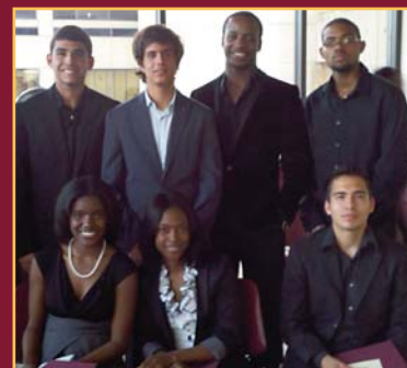
UDC Student-Athletes inducted into Phi Eta Sigma National Honor Society